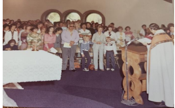
1976 The 1 st Liturgy in our New Church 250 families were in attendance.