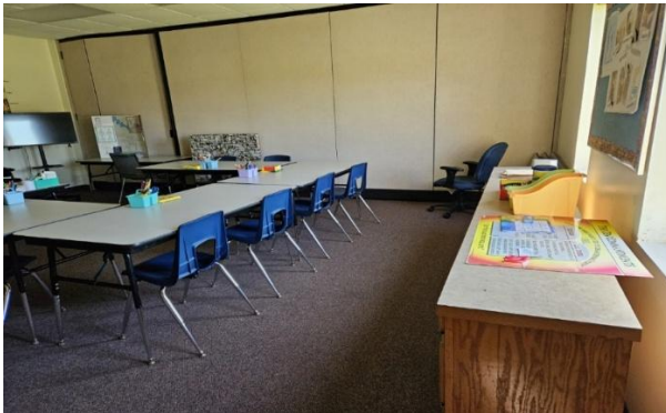
Parish School: One of four classrooms for Children's Religious Education. When enrollment is high, the Formal Library serves as a 5 th Classroom