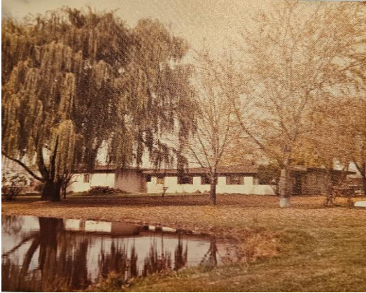
1975: Our 1 st Rectory