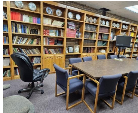
Formal Library Used for meetings and Religious Education