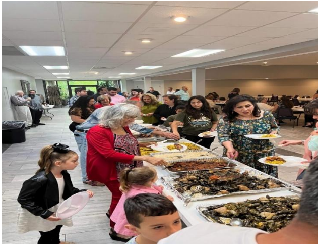
Annual Feast of the Assumption Parish Picnic (Indoor due to Weather)