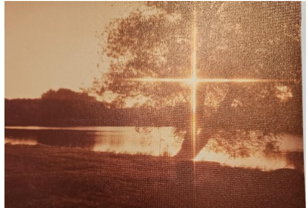
1975: Looking out the back window of our 1st Rectory at Sunset